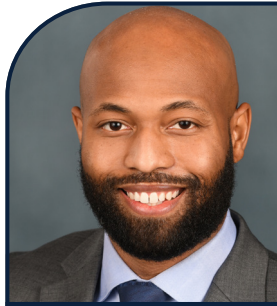
Kirkland Carden District 1