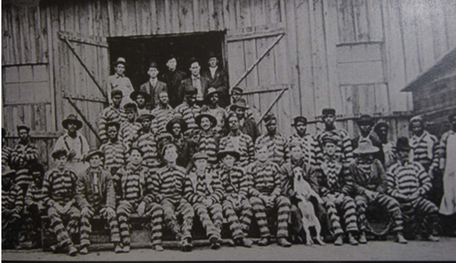
Prisoners of the State, July 1900